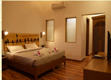
Executive King (32 m 2 ) Approx.