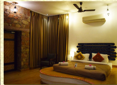
Luxury Spa (35 m 2 ) Approx.