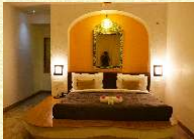
Executive Queen (28 m 2 ) Approx.

Nathdwara Temple – 50 Kms | Mount Abu – 170 Kms Jaipur – 335 Kms | Ahmedabad – 350 Kms